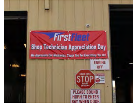
Thank You All!