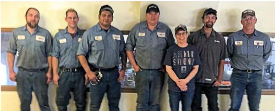
The Fountain, CO Crew