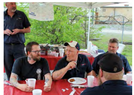
Enjoying the Day in Cleveland, TN