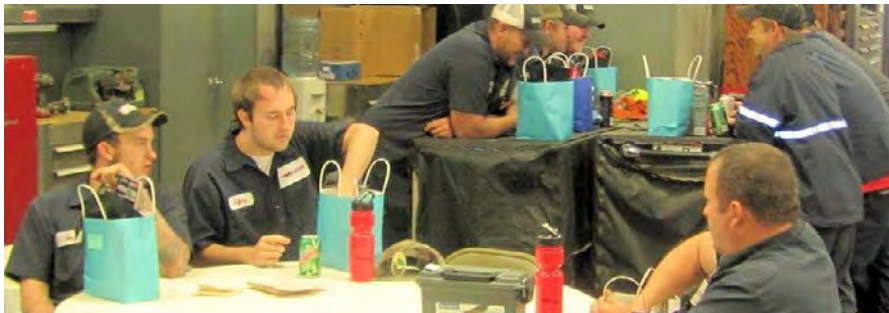
Enjoying the Day in Portland, TN

FirstFleet is very proud of our Maintenance Department and hope you all enjoyed the festivities! We look forward to making this an annual event!