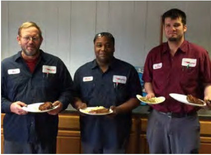
Enjoying the Day in Cedar Rapids, IA