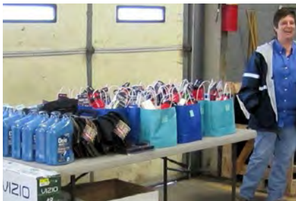
Portland, TN prizes – Amanda Cate