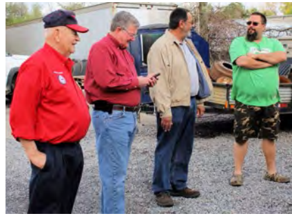
Enjoying the Day in Cleveland, TN