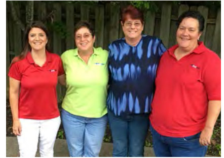
Corporate Maintenance Crew