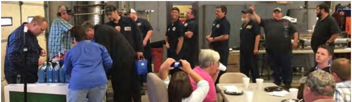
Enjoying the Day in Portland, TN