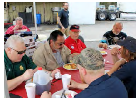
Enjoying the Day in Cleveland, TN