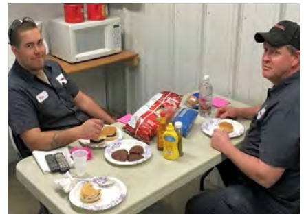
Enjoying the day in Ames, IA