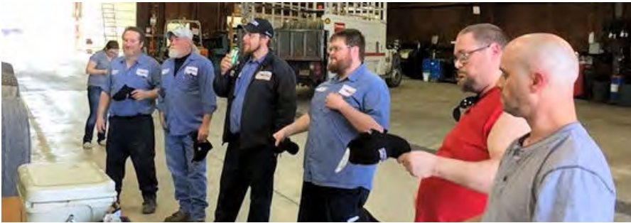
Enjoying the day in Bluffton, IN