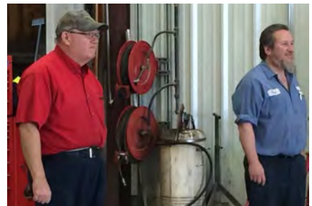
Corn Hole Competition, Bluffton, IN