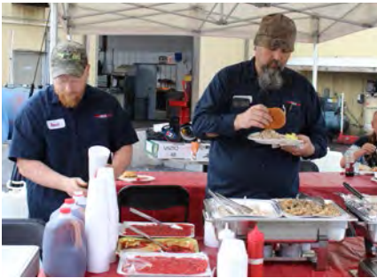
Enjoying Lunch in Cleveland, TN