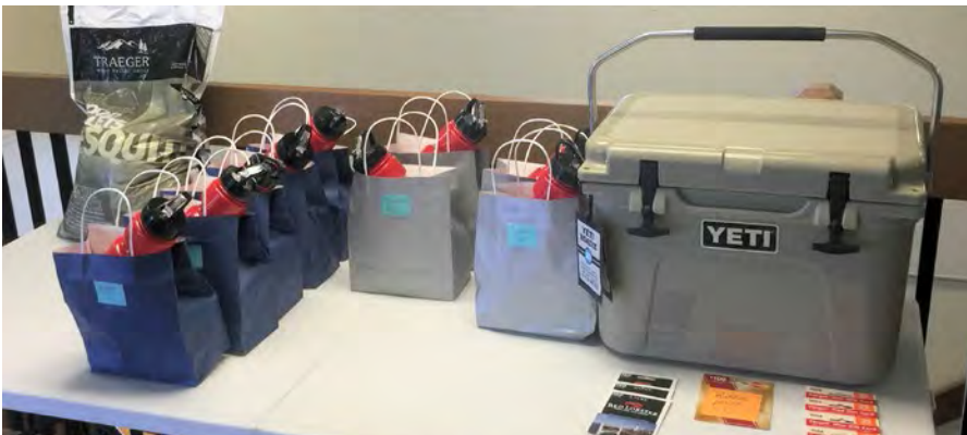
Prizes in Fountain, CO