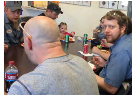
Enjoying lunch in Bluffton, IN