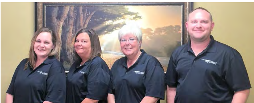
Breakdown Dept., Portland, TN