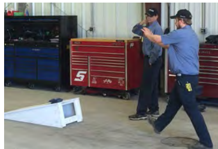
Corn Hole Competition, Bluffton, IN