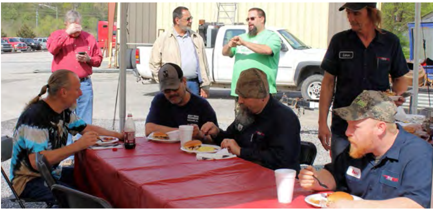
Enjoying the Day in Cleveland, TN