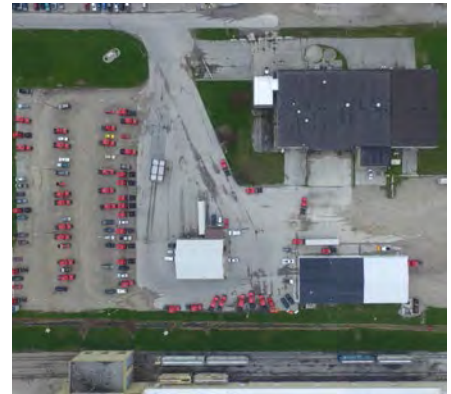
FirstFleet Shop and Operations

FirstFleet is very proud of the Bluffton Shop Personnel and appreciates their commitment and dedication!